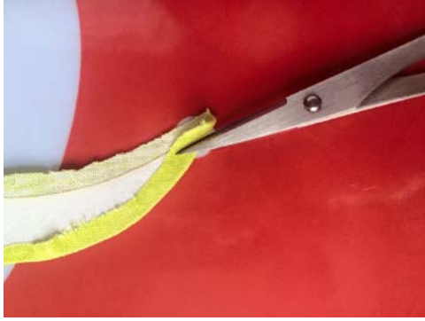
Step #13 - This is all that you trim