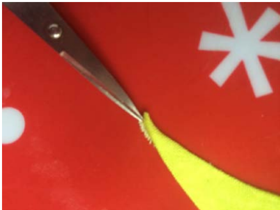
Step 17 - Just a little clip!