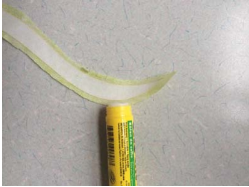
Step #15 - From the right side, you can see where it needs trimmed