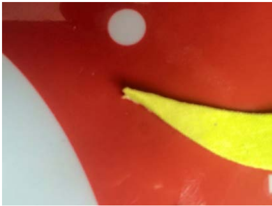
Step #16 - Trim your tip for the second time.