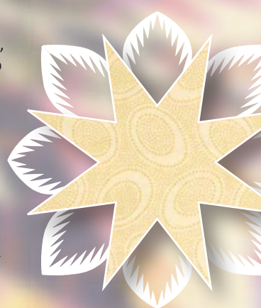
J2, J4, K3, L4, F1:a, F1:b, F9 GP71.IVORY 4 5/8 yd