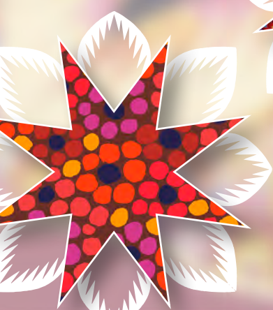
F2:a, F3:a, F4:a, F5:a, F6:a, F7:a PWPJ101.RED DANCING DAHLIAS 1 yd