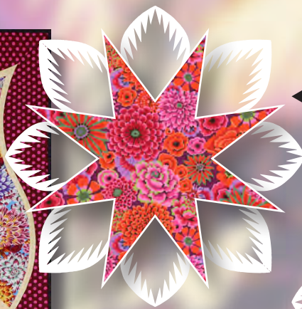
K1 PWGP172.RUST ENCHANTMENT 1/2 yd