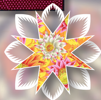
F2:b, F3:b, F4:b, F5:b, F6:b, F7:b PWPJ096. YELLOW 1 yd