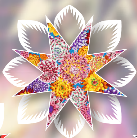
J1, M2 PWB077.WARM FLOWER DOT 5/8 yd