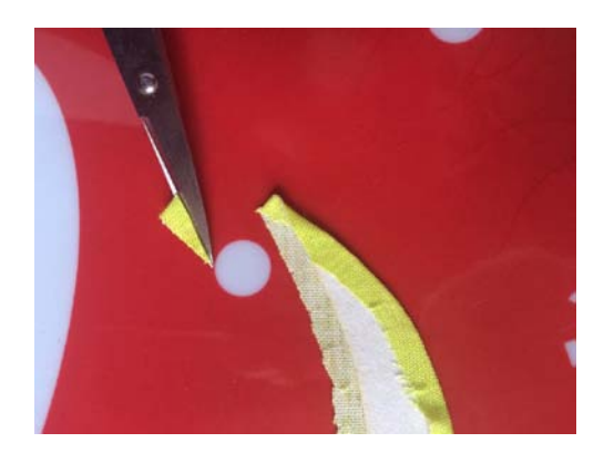
Step #14 - Fold over the other side of the tip