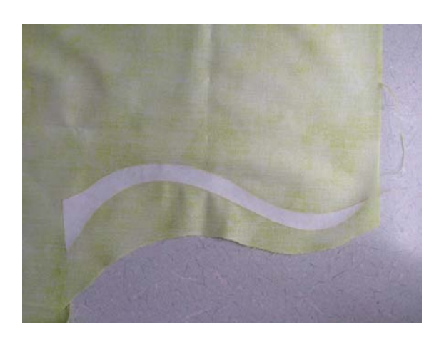
Step #5 - Trim the fabric "about" 1/4 inch from the applique