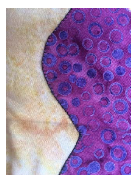
Step #20 - Here's the zig-zag from the back