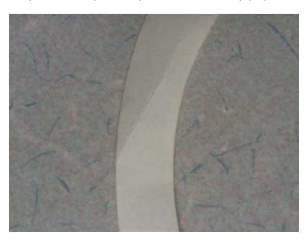
Step#3 - Peel the shiny paper off