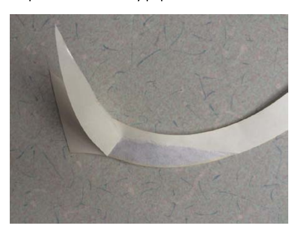
Step #4 - When the shiny paper is removed, the applique will stick to the wrong side of the fabric