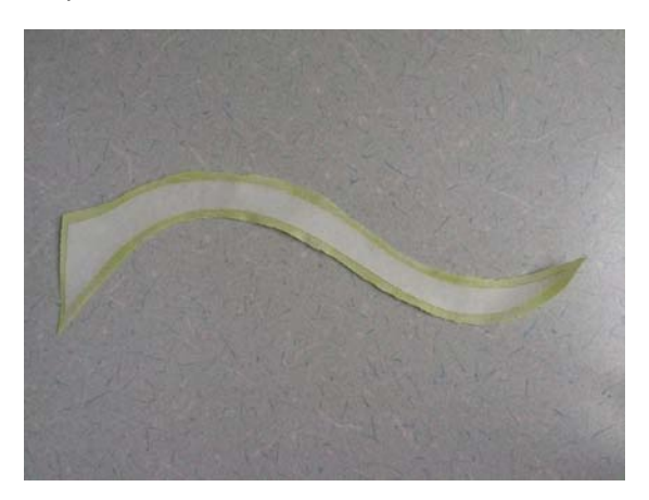
Step #6 - Clip inside curves with scissors.. but not all the way up to the applique paper, or you'll have "fuzzies". (Ask me how I know?!?). Just inside curves, not outside.