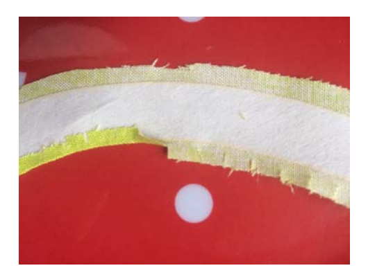
Step #11 - Your tip will look like this