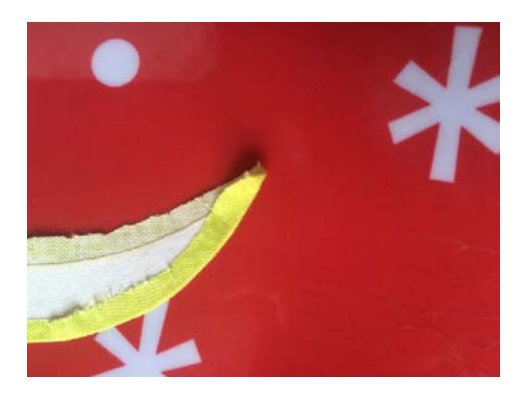
Step #12 - Clip off the tip, continuing the line of the applique (see placement of scissors)