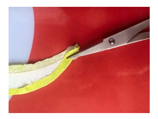
Step #13 - This is all that you trim