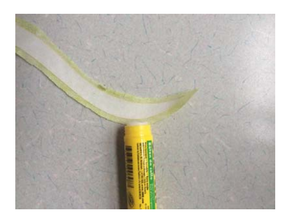
Step #15 - From the right side, you can see where it needs trimmed